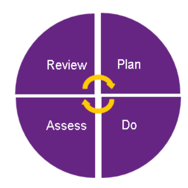
Figure 1: The impact cycle

We spoke to a dozen charities of different sizes that work on a variety of issues, to understand the challenges they face in turning data into action and get their advice on using data effectively. We asked: